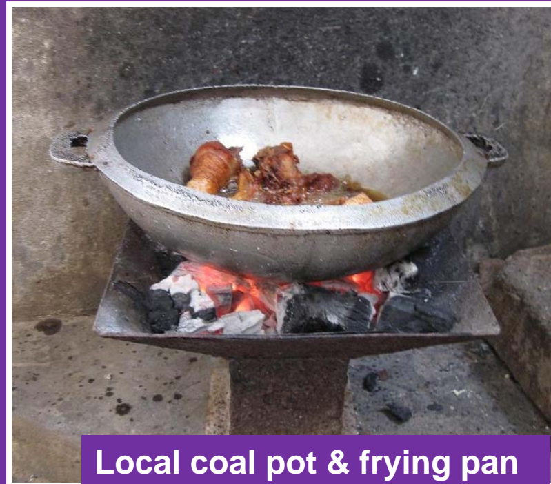
Local coal pot & frying pan