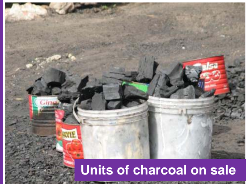
Units of charcoal on sale